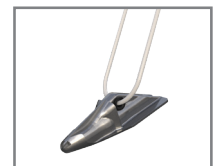
FTA (Fiber Tendon Anchor)