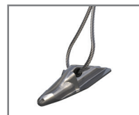
WTA (Wire Tendon Anchor)