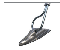
RTA (Rod Tendon Anchor)